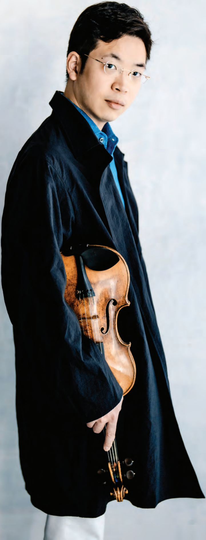
PAUL HUANG PERFORMS 2/1/26